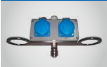
Energy Unit (available for all lifts)