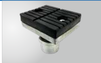
Electric Vehicle Footpad Kit