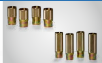
Pick Up Pad Extensions 75 mm & 150 mm (available for all lifts)