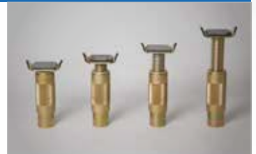
Pick Up Pads For Vans and Light Trucks (available for HL 4500)